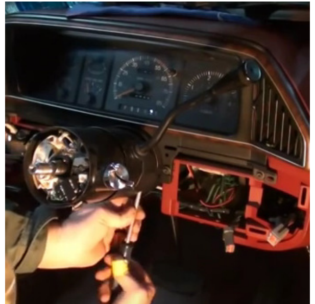
11. Remove the top and bottom column covers exposing the wires and switches