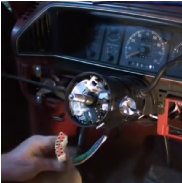
12. Disconnect the turn signal switch