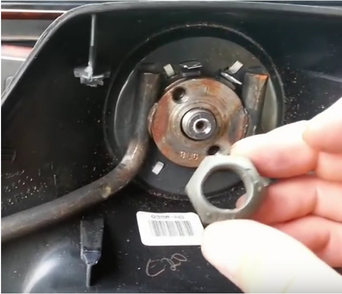
10. Remove the steering wheel